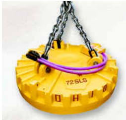
72 SLS Super Loadstar